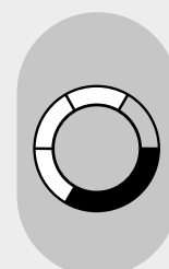
Volume Level 8